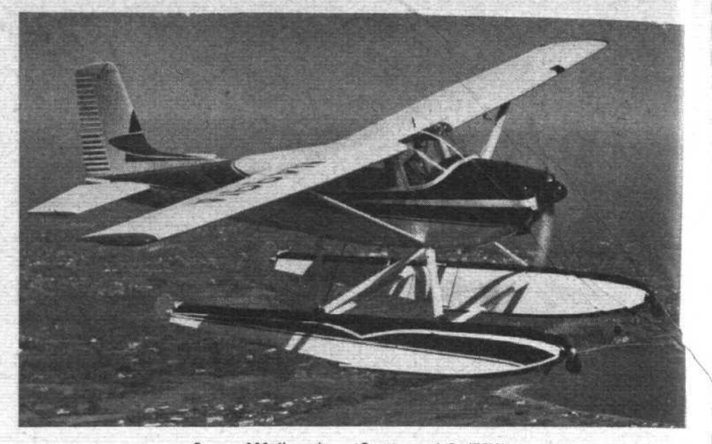
Cessna 180 floatplane (Continental O-470K)

620 Larger than any other Cessna product, the four-engined Model 620 is truly an airliner in miniature, embodying virtually all the refinements found in the largest long-range transports. Since 1954 a self-contained team of some hundred engineers has been engaged in its development; the prototype flew four-teen months ago and production deliveries are scheduled to begin in the first quarter of 1958.